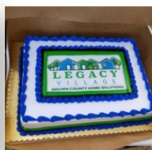
Open House a Success